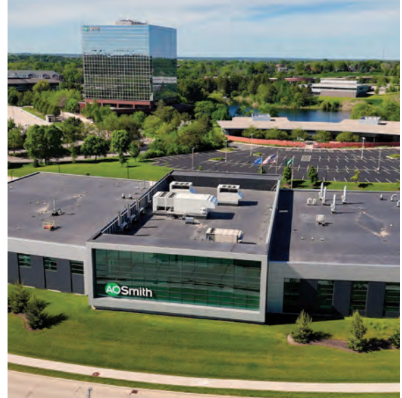
A. O. Smith World Headquarters in Milwaukee, Wisconsin

A. O. Smith Corporation is listed on the New York Stock Exchange and is part of the S&P 500 Index. The company has paid cash dividends on its common stock every year since 1940.