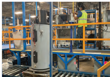
A heat pump water heater rolls off the new line in Ciudad Juárez, Mexico.

To help us further prepare for upcoming commercial regulatory changes, we're also expanding our operations in McBee, South Carolina. Updates will include a new coil line furnace, a robotic weld cell for the coil line, a coil line blaster, coil forming machines and other material handling equipment. These additions will increase production of our condensing commercial water heaters and storage capacity to quickly meet customers' needs. This project is being conducted in two phases with the first phase completion scheduled for Q3 2025 and the second phase in Q3 2026.