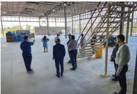
Select individuals received a sneak preview of the space under construction in August 2024.

In 2023, we broke ground on the new A. O. Smith Product Development Center in Lebanon, Tennessee, and in August 2024, we welcomed more than 50 key individuals for a sneak preview of the space under construction. This project combines a mix of new construction and existing facility renovation to create an environment where innovation and collaboration will thrive. The new center brings together the company's North America Water Heating commercial engineering and platform electronics functions with Lochinvar engineering and product management to support future commercial product production, including heat pump water heaters, boilers and other condensing technology. The A. O. Smith Product Development Center is designed to enhance knowledge-sharing across the organization and foster new ideas in a space conducive to collaboration. Once completed in April 2025, the facility will play a critical role in advancing product innovation and future sustainability efforts to help customers meet regulatory requirements and efficiency goals. When fully operational, the center will house more than 140 new and existing employees with room for future growth.