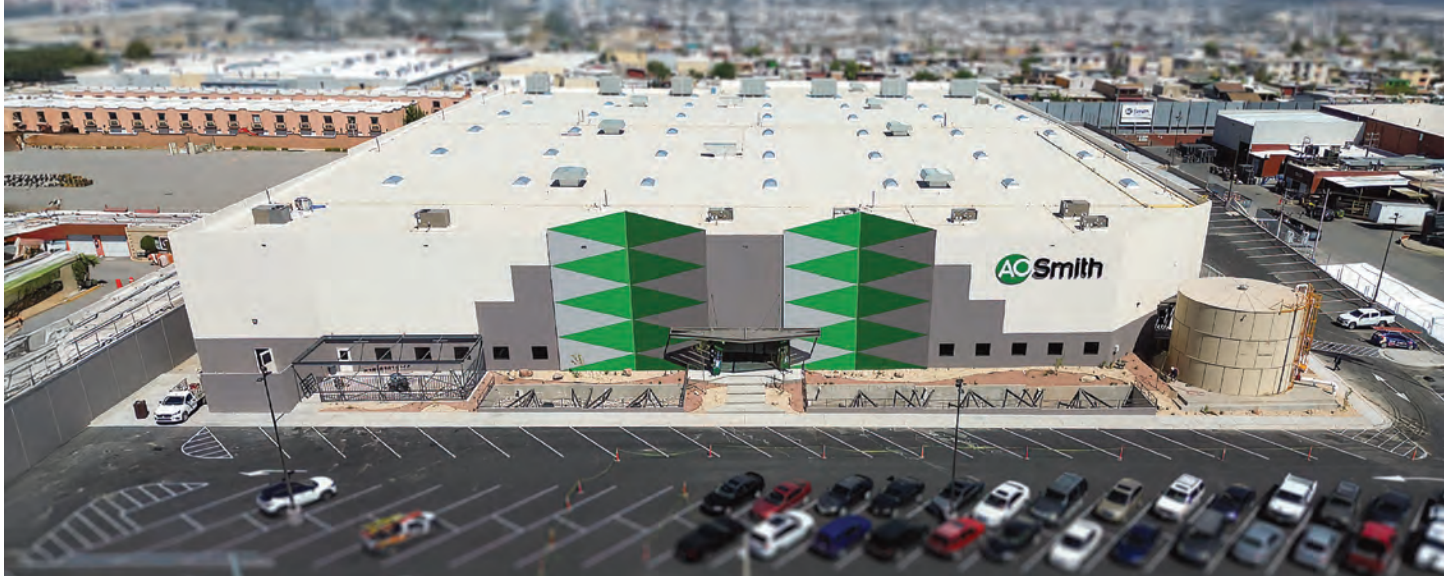
A third plant in Ciudad Juárez, Mexico, opened in September 2024, and has started producing tankless water heaters.