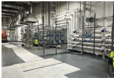
The center's new product development lab is designed to test and analyze unit performance using real-world conditions.