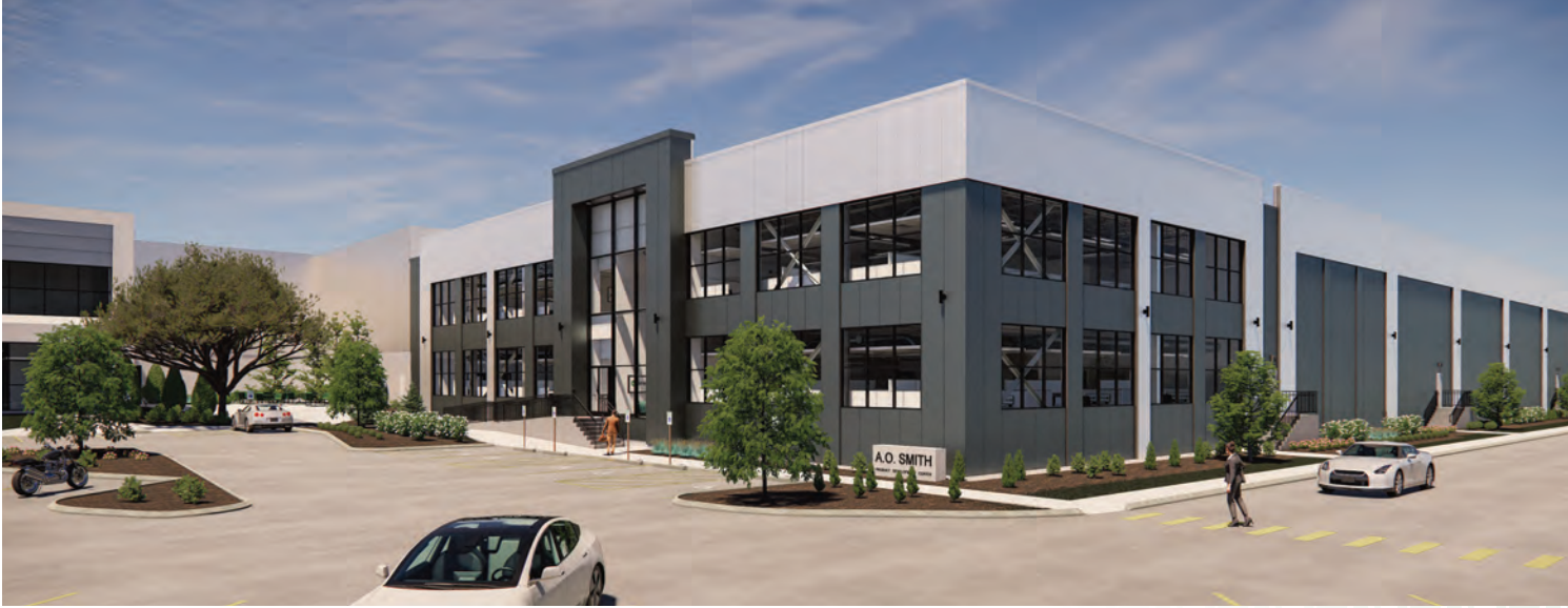
The new A. O. Smith Product Development Center in Lebanon, Tennessee, will celebrate its grand opening in April 2025.