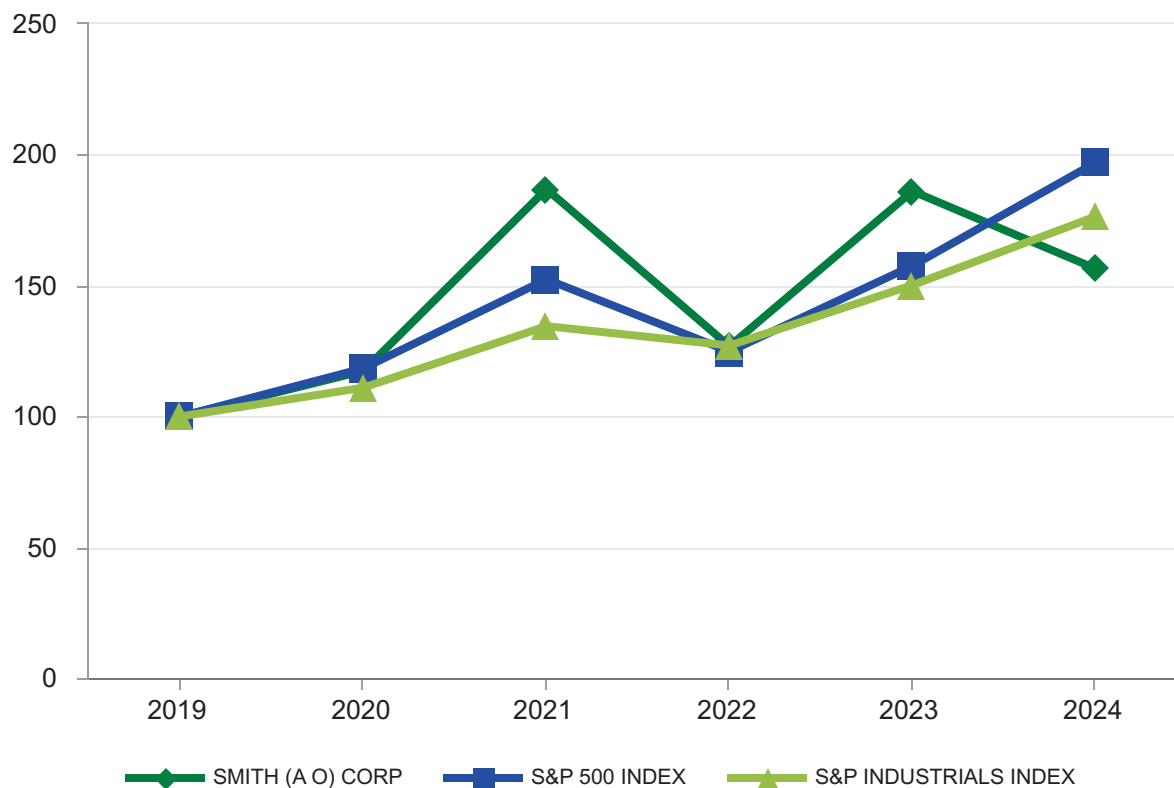
Comparison of Five-Year Cumulative Total Return From December 31, 2019 to December 31, 2024 Assumes $100 Invested with Reinvestment of Dividends

The graph below shows a five-year comparison of the cumulative shareholder return on our Common Stock with the cumulative total return of the Standard & Poor's (S&P) 500 Index, S&P 500 Select Industrials Index, which are published indices.