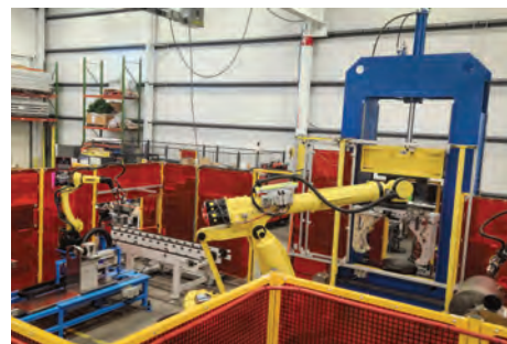
The robotic welding cell for the new coil line in McBee, South Carolina, was installed in February 2025.