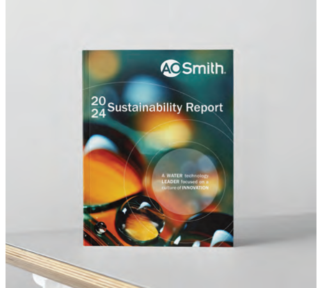
A. O. Smith 2024 Sustainability Report

In March, we were recognized as a 2024 World's Most Ethical Company by Ethisphere, a global leader in defining and advancing the standards